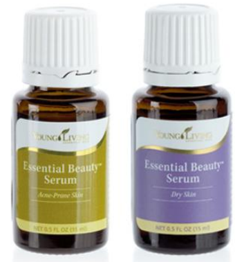
Essential Beauty Serums p. 74