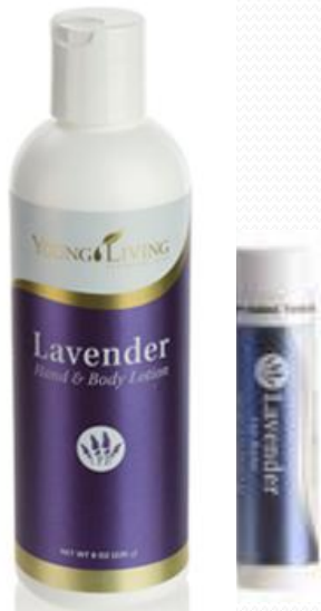
Hand & Body lotion p. 76-77